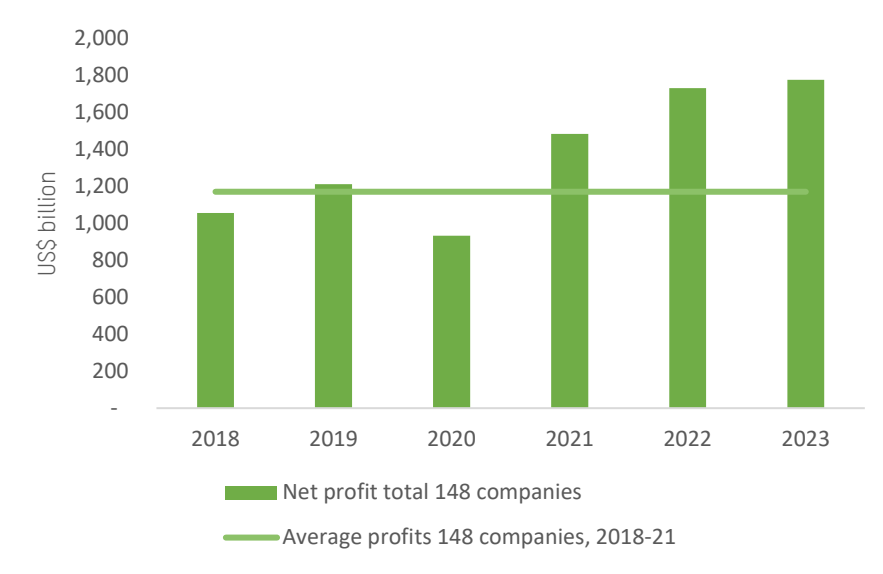
Figure 2.0: Net profits of 148 of the 200 largest companies in the world between July 2017–June 2023, US$ billions

Note: The data is for 12 months to June of each year.