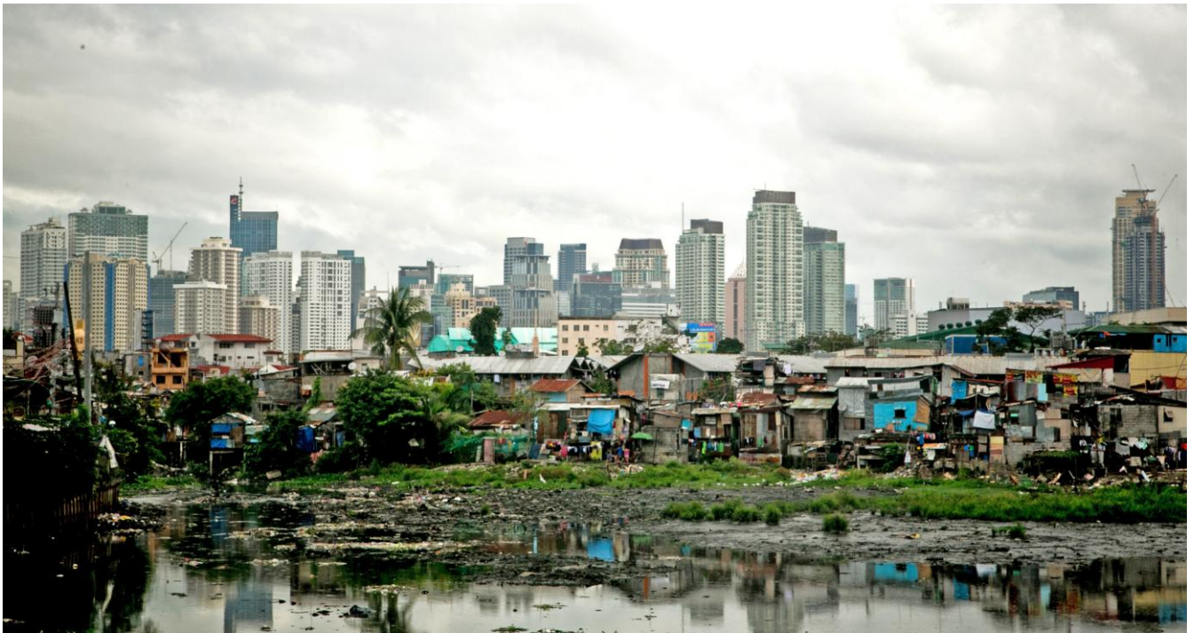
Tondo slum in Manila, Philippines (2014).