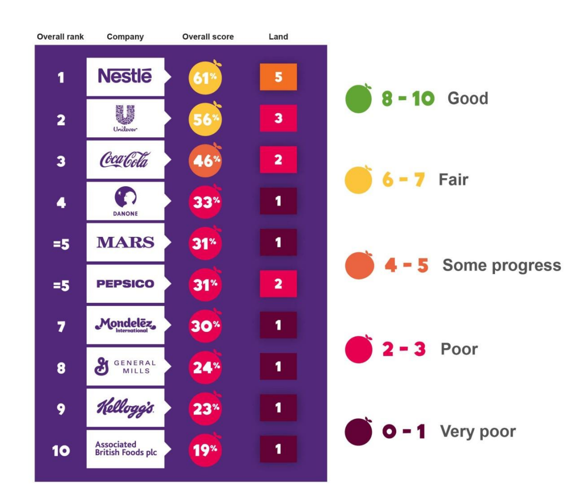
Figure 3: Behind the Brands scorecard results for land, 2013

The examples of land conflict described in the previous section all involve companies that supply the food manufacturing industry. Do the Big 10 have adequate measures in place to identify, prevent, and address land conflicts in their supply chains? Given that, of the seven areas in the scorecard,<sup>82</sup> land is the one in which the Big 10 perform the worst, the answer has to be 'no'.