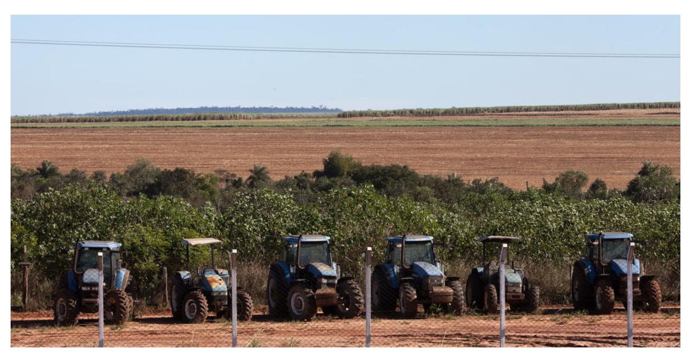
Tractors on a sugar cane plantation which occupies ancestral land of the indigenous group Guarani-Kaiowá. The displaced community now lives in a temporary camp next to the land on the side of Highway BR-163, Mato Grosso do Sul.