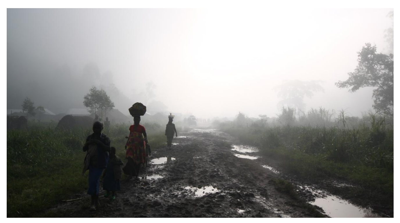
On the road between Kashuga and Mweso, Masisi, North Kivu, February 2013. A group of women and girls returning from the market.