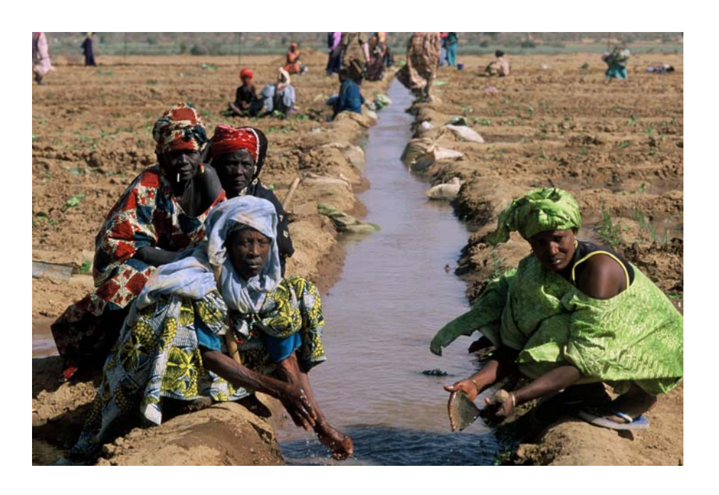
Women wash their hands in an irrigation channel in the lands of Djoudé's women cooperative, Mauritania.

Building a rescue package to set the MDGs back on track