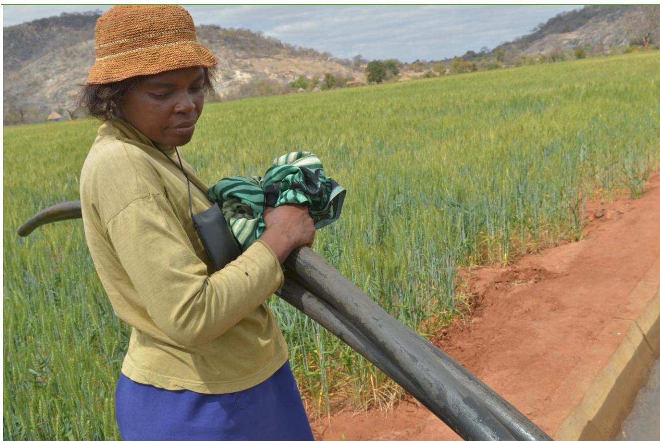
Ipiashe siphons water for irrigation, Gutu Province, Zimbabwe, September 2011.